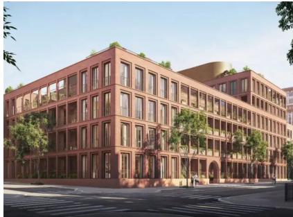
110 Boerum Place