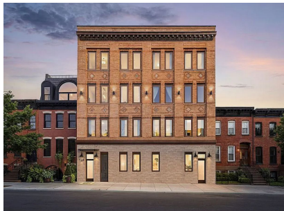
The Candy Factory