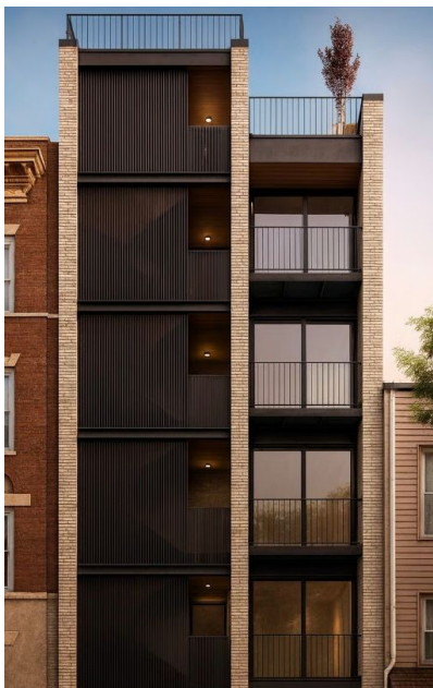
215 Calyer Street