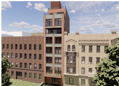
311 Eastern Parkway