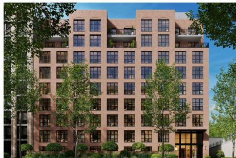
106 Graham Avenue