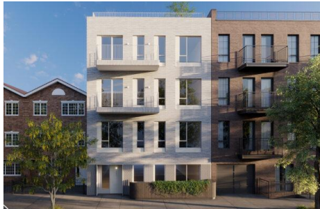
331 Fenimore Street